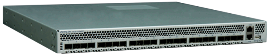
Arista 7124SX: 24-port 10GbE 480Gbps switch

The Arista 7124SX switch is a high performance, ultra-low latency layer 2/3/4 10 Gigabit Ethernet switch. Offered with 24 1/10GbE ports in a compact and power efficient 1RU chassis, the Arista 7124SX forwards packets in less than 500 nanoseconds. All ports accommodate the full range of 10GbE SFP+ and GbE SFP options, allowing for maximum flexibility and investment protection as customers of all sizes migrate their server connections from Gigabit to 10 Gigabit Ethernet. With Arista EOS, advanced monitoring and provisioning capabilities such as Latency Analyzer, Zero Touch Provisioning, VMTracer and Linux based tools can be run natively on the switch. A built in SSD is available for advanced logging, data captures and various services that can now be run from the switch.