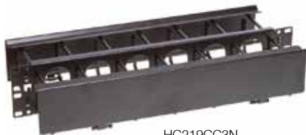
HC219CC3N - Front and rear cover shown